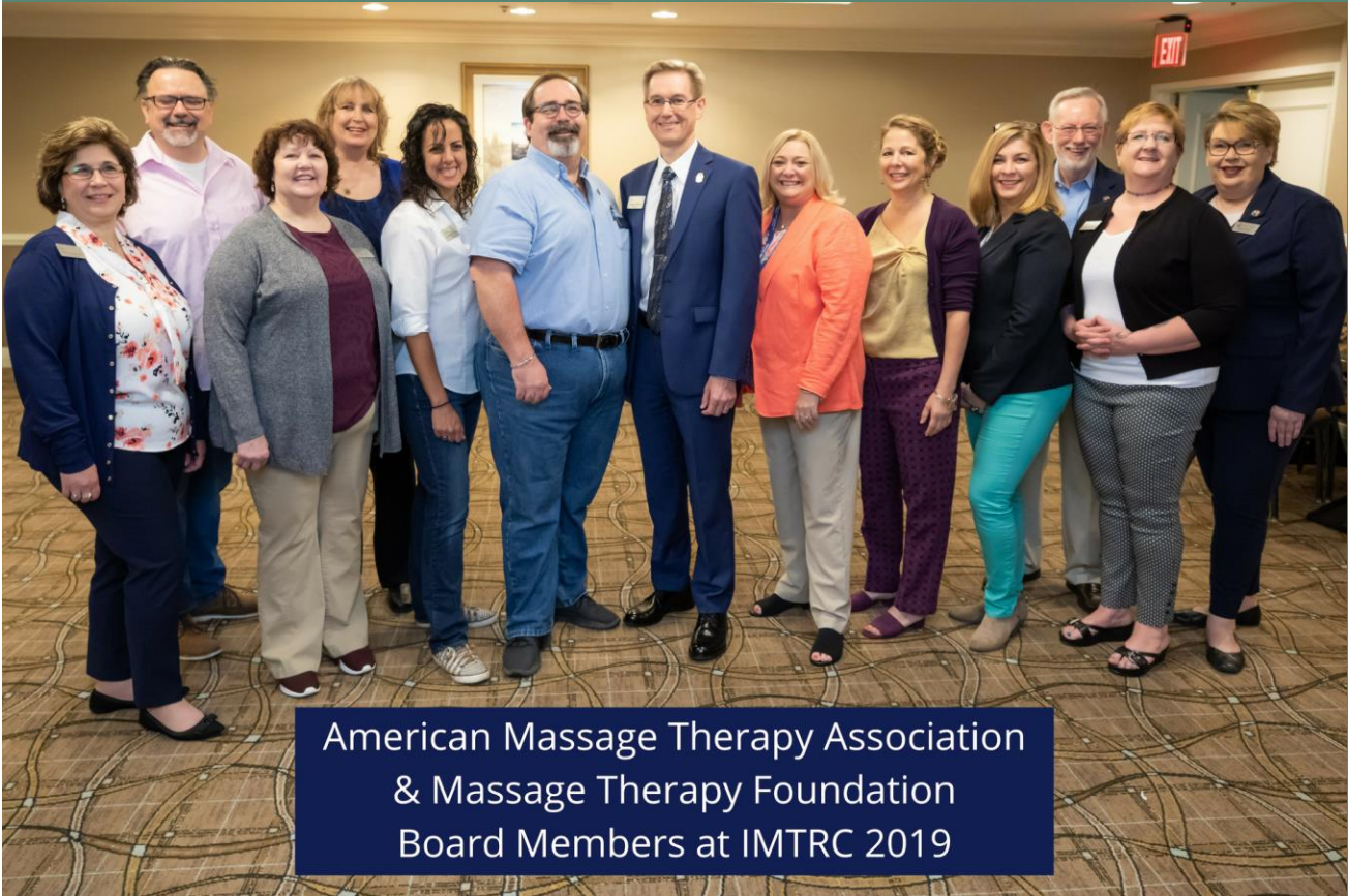
American Massage Therapy Association & Massage Therapy Foundation Board Members at IMTRC 2019

Our deepest appreciation to the American Massage Therapy Association (AMTA) for being the presenting sponsor for IMTRC 2019